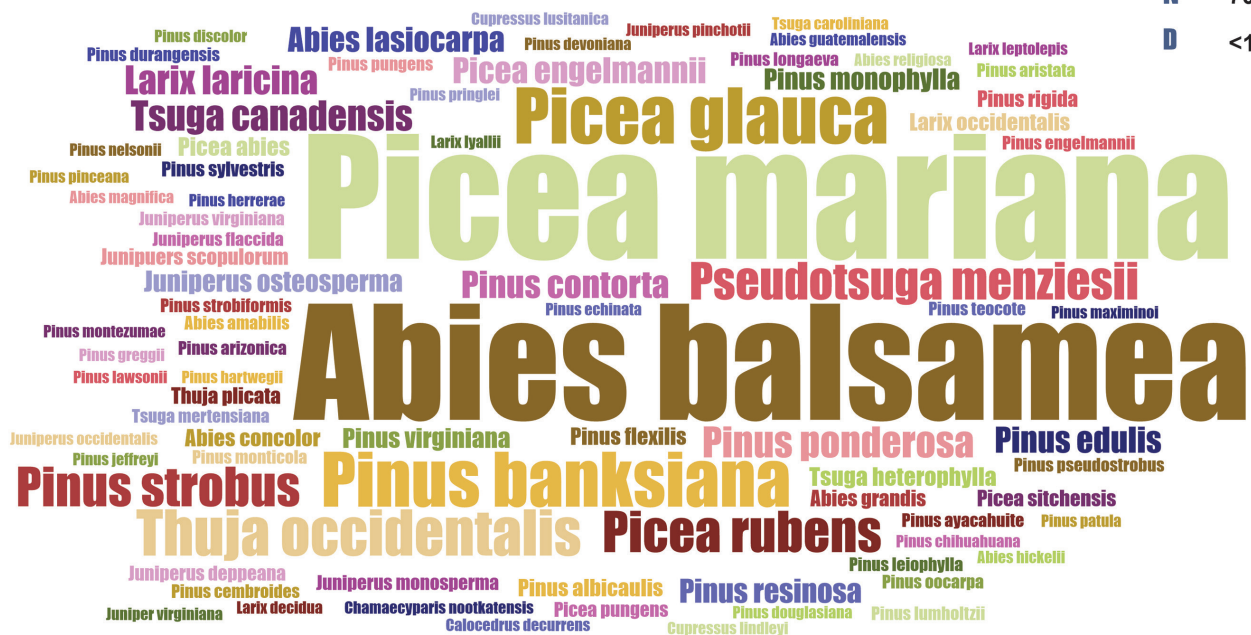
Figure 3. Relative number ( n ) of tree samples from (a) angiosperm and (b) gymnosperm species in the tree-ring collections across North America (table 1). The figure shows 155 different species names, with frequencies ranging from 1 to more than 40,000.

late-1990s. Although tree-ring data were collected during plot establishment, there are currently no inventory-wide plans for sampling increment cores during plot remeasurement. Like in Canada, there is considerable variability in the representation of legacy increment core inventories across the four major US regions (Northern, Southern, Interior, and Pacific including Alaska). The archive of tree-ring data from inventories prior to the 2000s, combined with the current annual inventory, includes more than 24,000 cores from eight interior Western states (DeRose et al. 2017), with